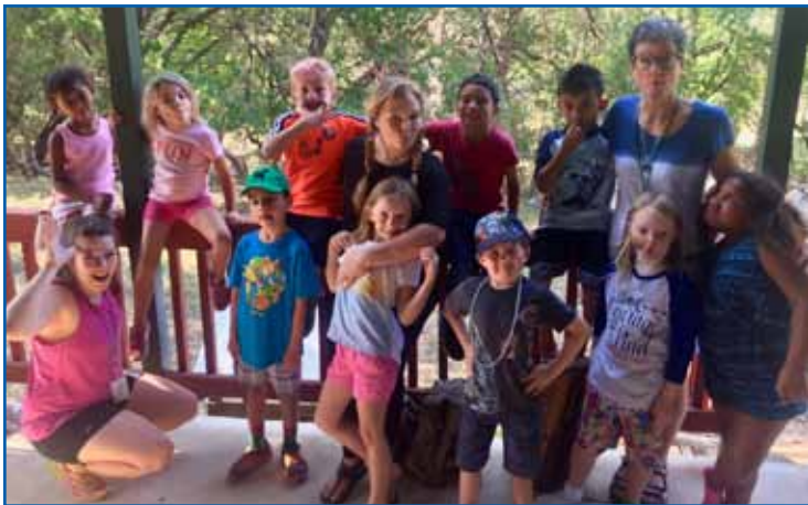
Campers have fun while learning skills to cope with their loss