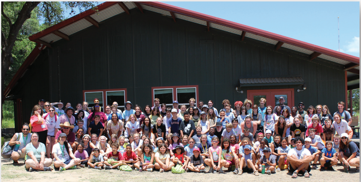
Camp Brave Heart 2022