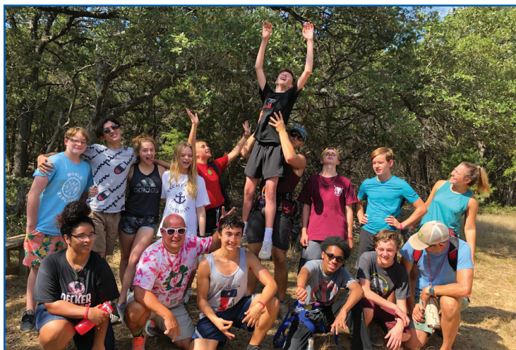
Campers have fun while learning skills to cope with their loss