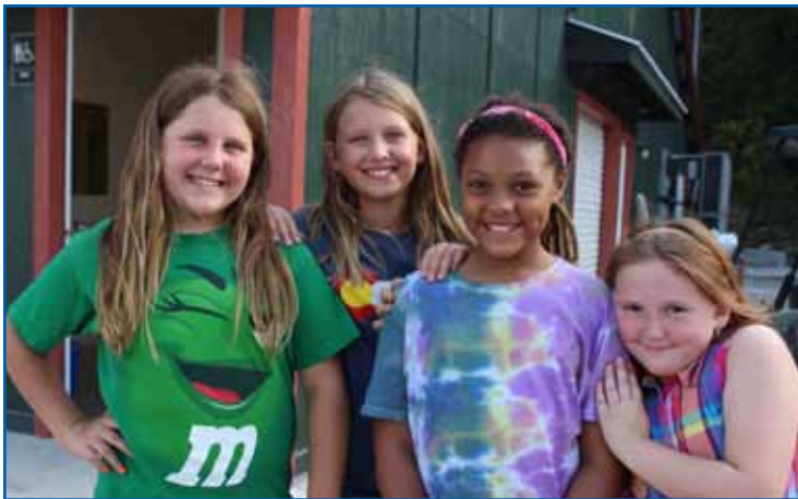
Campers offer each other support at Camp Brave Heart.